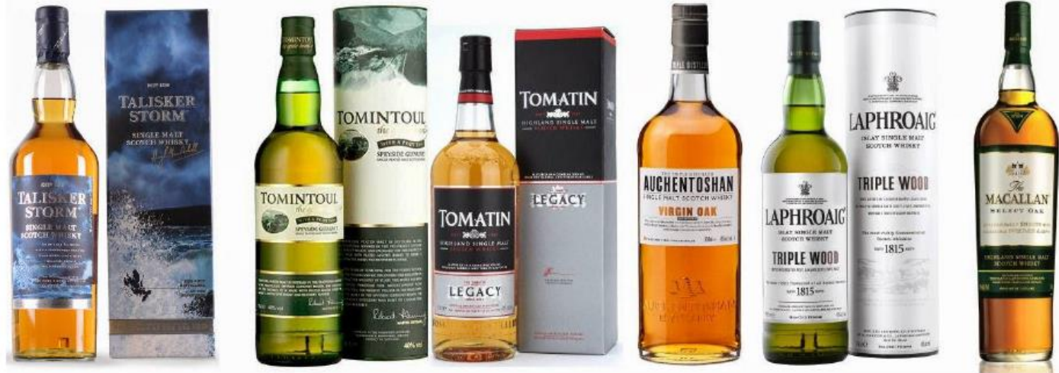
A random selection of modern NAS whiskies